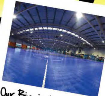
Our Birmingham Arena