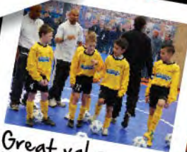
Great value Kids parties

This page is available for advertising. Please enquire for further information.