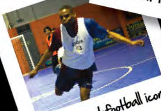
Be the next football icon