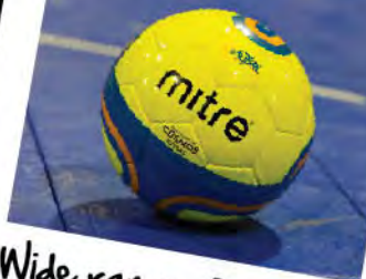
Wide range of extra's