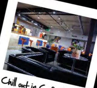
Chill out in Cafe Kickz

Play the fastest growing sport on the planet!!