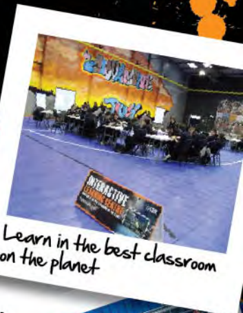
Learn in the best classroom on the planet

Our sports scholarships are centred around the only FIFA approved indoor football format called Futsal. Read on to find out more about the fastest growing sport on the planet.