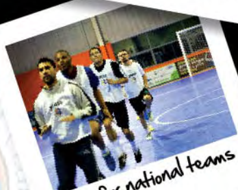
Play for national teams & pro clubs